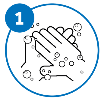
Prior to any task, wash your hands for at least 20 seconds, then rinse and dry thoroughly.

Common hand-touch surfaces should be cleaned and disinfected using a two-stage process - Stage 1: Clean, Stage 2: Disinfect.