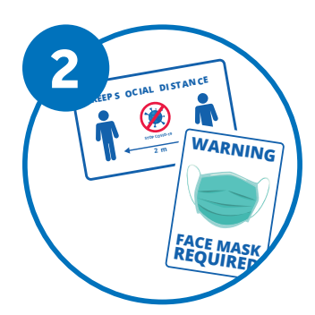
Follow your site safe work practices, to protect yourself and others.