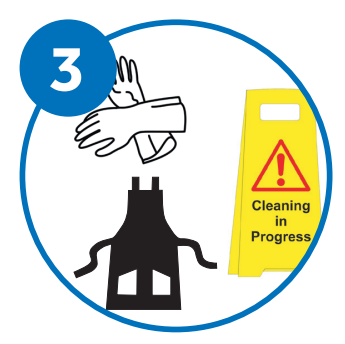
Ensure you wear appropriate PPE and place any safety signs, if required.