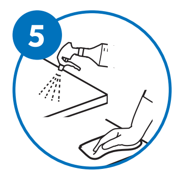
STAGE 1: Clean surface with a suitable cleaner.